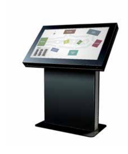
Floor Standing Landscape Kiosk For 40", 42", 46", 47" screens up to 2.25" thick KIL546 shown in black