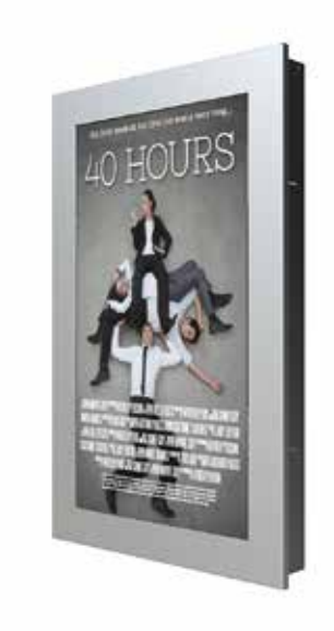
In-Wall Kiosk, Portrait & Landscape models For 40", 42", 46", 47" screens up to 2.25" thick KIP746 shown in silver