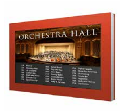
Wall Kiosk, Portrait & Landscape models For 40", 42", 46", 47" screens up to 2.25" thick KIP647 shown with custom color