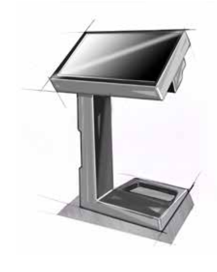
Don't see a design or size you're looking for? Contact our dedicated Kiosk design team to develop a solution that perfectly matches your vision.