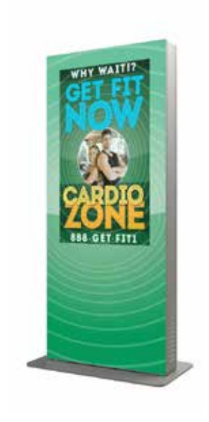
Floor Standing Portrait Kiosk For 40", 42", 46" 47", 55" screens up to 4" thick KIP546 shown with vinyl wrap