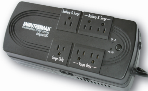
EnSpire EN600 - 600VA/300W Standby UPS

The Minuteman® EnSpire™ Series UPS is an exciting new UPS line that provides the features needed to protect your valuable equipment in a low-cost product.