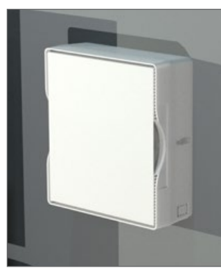
Retrofit construction (Brownfield) on-wall Installation