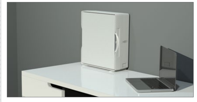
Freestanding (w/accessory feet)