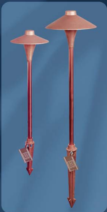
China Hat Area/Path Light (Small and Large) (CCH1CB, CCH2CB)