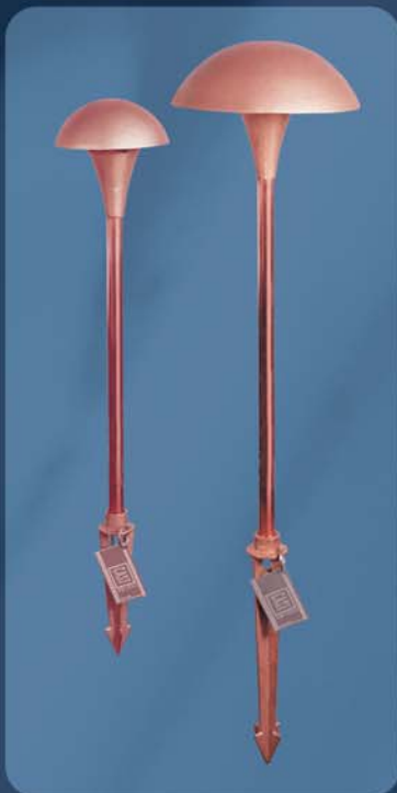
Mushroom Area/Path Light (Small and Large) (CMU1CB, CMU2CB)