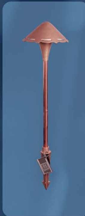
New Orleans Area/Path Light (CNO1CB)