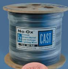
Spider Splice ®