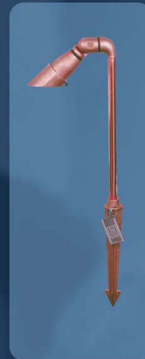
MR-16 Area/Path Light (CBAL1CB)