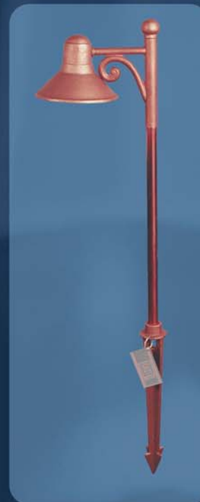
Savannah Area/Path Light (CSA1CB)