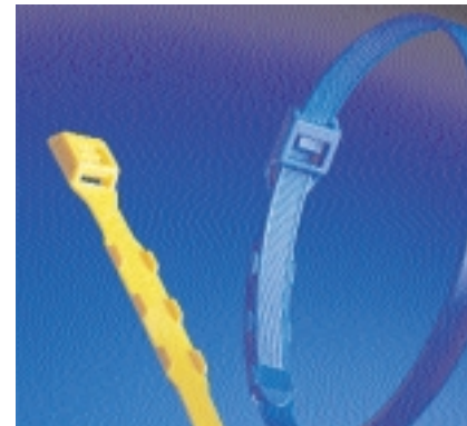
Retainer (PER) Version

The parallel entry tie also offers an optional custom designed feature for foam applications, such as playground equipment. With child safety in mind, the patented retainer bumps on the strap allow the tie to grip into foam padded equipment eliminating slippage. The retainers also contain the tail of the tie eliminating the need to cut any excess material. This feature eliminates the potential for any sharp edges. Only a smooth surface is evident. The "PER" designation in the part number indicates the retainer feature.