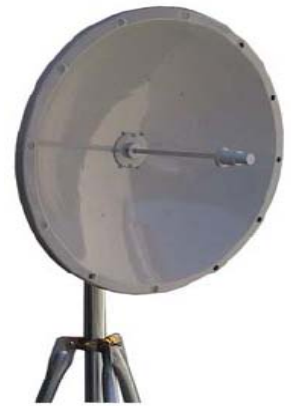
Parabolic dish antenna