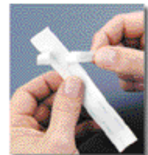
Easy-peel split-back label