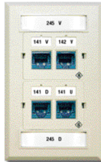
Fixed Length Labels