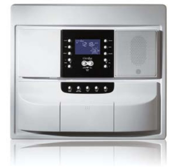
Shown with optional 6-disc changer