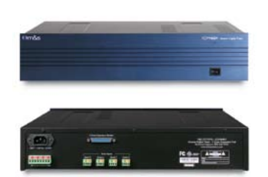
Expansion Hub XDM46EH