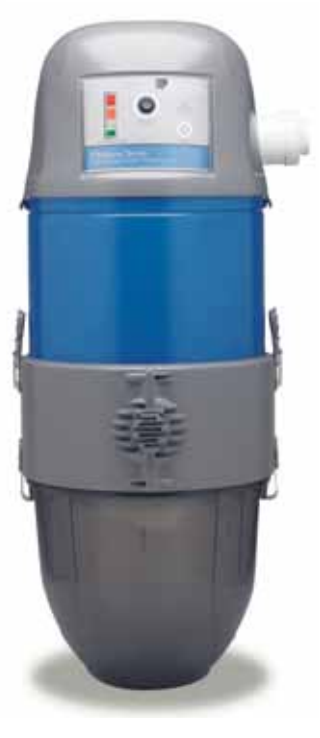
Platinum Series Model (bagged)