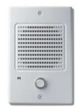
Door Speaker DS3B2