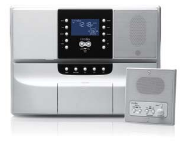
Shown with optional 6-disc changer and room station