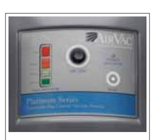
EXTRA SMART four-color segmented display on the Platinum Series shows bag debris level, two-color status indicator shows power and motor life.