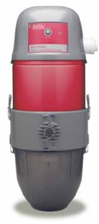
Red Series Model (bagless)