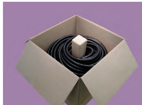
Polyethylene Split Loom – Bulk Box