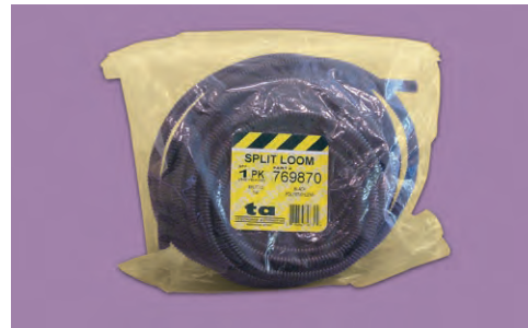
Split Loom Packaging – 50ft Pack